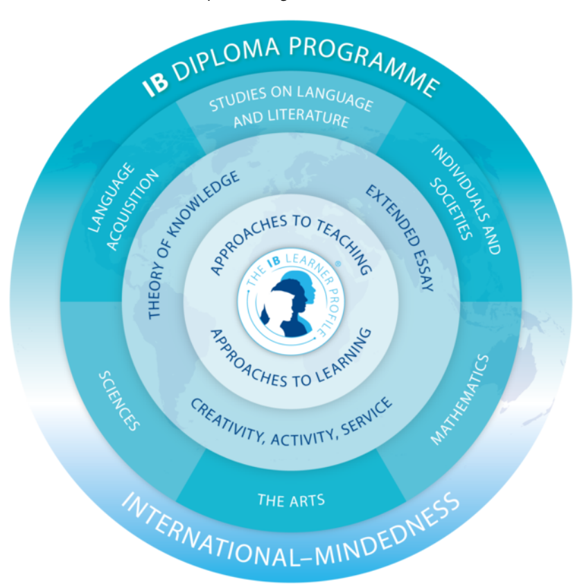
Figure 1 Diploma Programme model

The course is presented as six academic areas enclosing a central core (see figure 1). It encourages the concurrent study of a broad range of academic areas. Students study two modern languages (or a modern language and a classical language), a humanities or social science subject, an experimental science, mathematics and one of the creative arts. It is this comprehensive range of subjects that makes the DP a demanding course of study designed to prepare students effectively for university entrance. In each of the academic areas students have flexibility in making their choices, which means they can choose subjects that particularly interest them and that they may wish to study further at university.