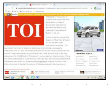
Cygnus feels proud to share the coverage of the Cygnus Tournament in the TOI dated 26-11-19