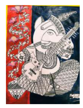
Dolly Alwani, VII B